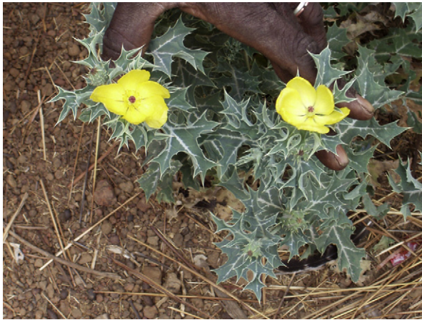
Figure 1. Argemone mexicana L. (Papaveraceae).

lead to the very widespread use of ACTs, and a greatly increased risk of resistance.