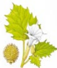
Datura stramonium JIMSON WEED