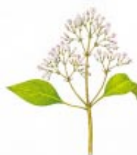
Cinchona pubescens FEVER TREE