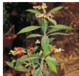
Rauvolfia serpentina INDIAN SNAKEROOT