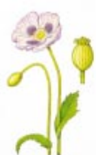
Papaver somniferum OPIUM POPPY