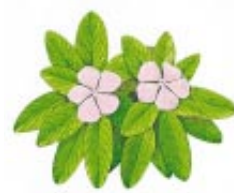
Catharanthus roseus ROSY PERIWINKLE

are more targeted. In phylogenetic surveys, researchers choose close relatives of plants known to produce useful compounds. In ecological surveys, they select plants that live in particular habitats or that display characteristics indicating they produce molecules capable of exerting an effect on animals. Collectors might, for example, focus on specimens that seem to be immune from predation by insects. The absence of predation suggests a plant may produce toxic chemicals. Many chemicals that are toxic to insects also show bioactivity in humans, which means they might be capable of achieving some therapeutic effect.