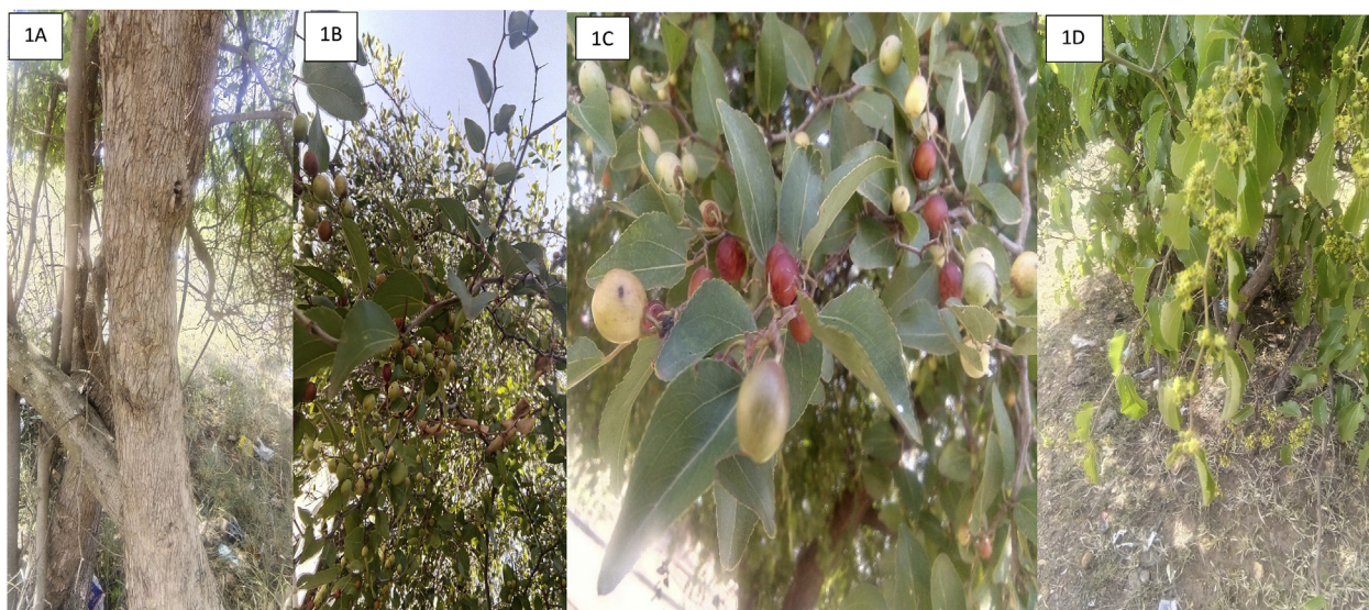
Figure 1. Different plant parts of Ziziphus mucronata (stem bark, 1A), (Leaves, thorns, green and ripe fruits, 1B & 1C), (Leaves and flower, 1D).

In South Africa, Ziziphus mucronata is distributed all over the country; Limpopo, Mpumalanga, Kwazulu-Natal, Eastern Cape, Northern Cape, North West, Gauteng and Free State Province; except in the Western Cape Province (Figure 2). In other African countries, the plant species is found in Angola, Botswana, Eritrea, Ethiopia, Ghana, Kenya, Lesotho, Mozambique, Zambia, Namibia, Niger, Senegal, Somalia, South Africa, Sudan, Swaziland, Tanzania, Uganda and Zimbabwe and grows in all types of soil and standing intense heat and cold equally well [37].